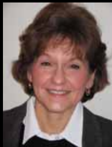
Governor Peggy Hughes